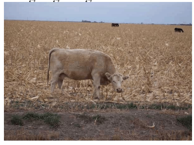
Figure 1. Cattle grazing crop residue.

The five-year average of corn acres harvested reported by NASS leads to an estimate of approximately 5.5 million acres of corn and 200,000 tons of residue produced annually in Kansas. In addition, 2.8 million acres of grain sorghum and 70,000 tons of residue were produced. While not all acres are suitable for grazing, this represents a tremendous resource for the state. Residue yield and nutrient contents are dependent on grain yield, fertility, harvest date, and conditions at harvest. Nutrient content of residues is additionally impacted by duration and timing of grazing initiation.