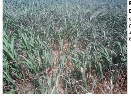
Figure 1. Drought-stressed forage sorghum.

Drought-stressed crops such as corn and sorghum tend to accumulate high nitrate levels in the lower leaves and stalk of the plant (Figure 1). Nitrates accumulate in the lower portion of these plants when stresses reduce crop yields to less than expected, based on the supplied nitrogen fertility level. Nitrate toxicity in livestock is because of its absorption into the bloodstream and binding to hemoglobin, rendering it unable to carry oxygen throughout the body. The result eventual asphyxiation and death.