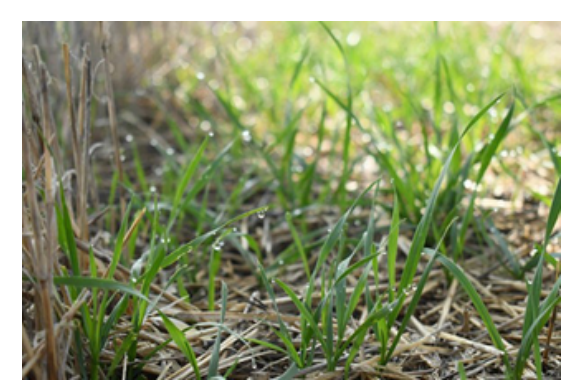
Wheat streak mosaic virus: Early control of volunteer is crucial

Wheat streak mosaic virus could be problematic this coming season, with rainfall encouraging volunteer development in parts of Kansas. One of the best preventative measures for wheat streak is the control of volunteer wheat early and often after harvest. If volunteer wheat is allowed to stand, it creates a "green bridge", allowing wheat streak mosaic and wheat curl mites to survive locally. Volunteer wheat should be terminated at least two weeks prior to planting to allow sufficient time for mites to die off. Growers should be mindful of volunteer wheat that may "hide" in double-cropped soybeans or cover crops.